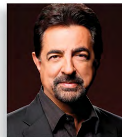
Joe Mantegna Award-Winning Actor