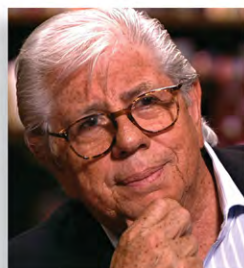
Carl Bernstein Pulitzer Prize-Winning Journalist and Author