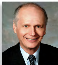
Richard Riley Former U.S. Secretary of Education