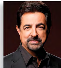
Joe Mantegna Award-Winning Actor