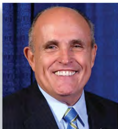
The Hon. Rudolph W. Giuliani Former Mayor of New York City