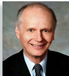
Richard Riley Former U.S. Secretary of Education