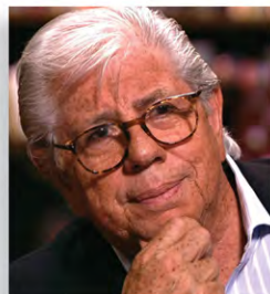
Carl Bernstein Pulitzer Prize-Winning Journalist and Author